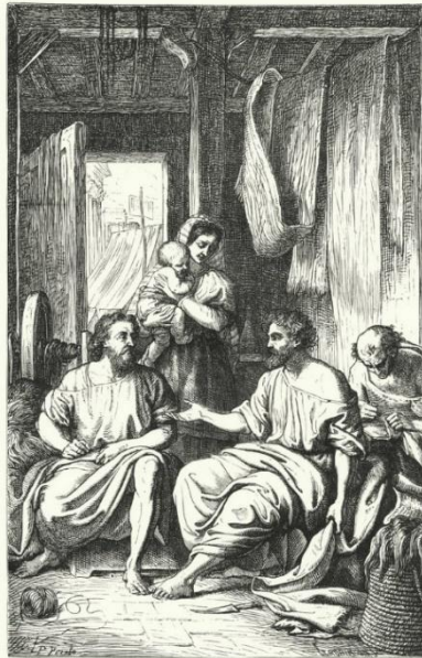
PAUL IN THE HOUSE OF AQUILA AND PRISCILLA

From the beginning, work is ordained as part of the human lot, celebrated as sharing in God's creation (Gen. 3). Jesus called his first disciples to follow him from their vocations but the fishermen, at least, went back to their secular professions from time to time. Jesus did not require all his followers to give up their everyday work and much of his teaching drew on themes from the world of everyday work. St. Paul also regarded work positively, encouraging all Christians to continue in their work and to do it well (Colossians 3:23-24; 1 Thessalonians 4:11-12) and, of course, he supported his ministry by continuing to work as a tentmaker (Acts 18:3). Whilst the Bible promotes honest work, it has some very harsh words for those who don't work. Probably the strongest language is in 2 Thess. 3.10-12: "The one who is unwilling to work shall not eat."